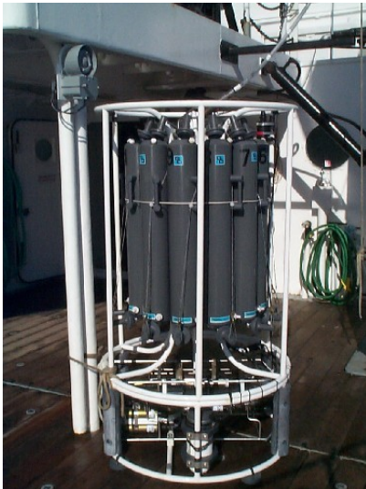
CTD: Conductivity/Temperature/Depth. A rosette with instrumentation and Niskin bottles for water collection, deployed vertically.