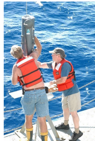
Go-Flo Bottle: Used to collect water from a single depth, closed by messenger. Portable winch will be used to deploy these bottles.